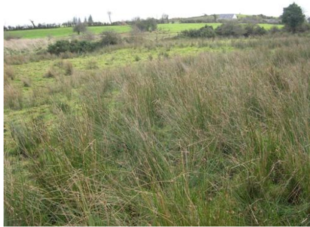
Plate 56 View of proposed pond at Aghalenane Lough, looking southeast. CHC 62 wetland area in the background