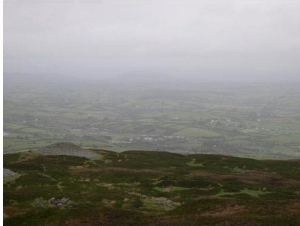
View from Carrowkeel Cemetery facing northeast towards Castlebaldwin village