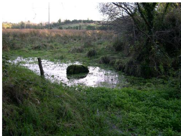
CHC 96 – Recorded monument SL034-186 (Holy well site), Cloghoge Upper Td