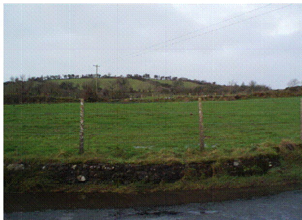
Spoil Repository Area SR/BP Type 01-No.04 in the middleground