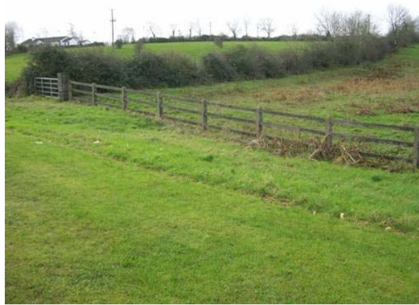
Plate 2 CHC 02 – Recorded Monument SL026-026 (Holy Well, Souterrain, Ringfort, Ecclesiastical remains), Toberbride Td