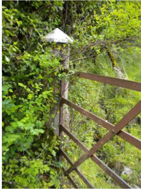
Plate 17 CHC 22 – Gateway with stone piers, Ardcurley Td with location of proposed pond at c. Ch. 2,100